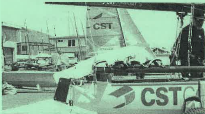
When I grow up wanna be an Aussie 18